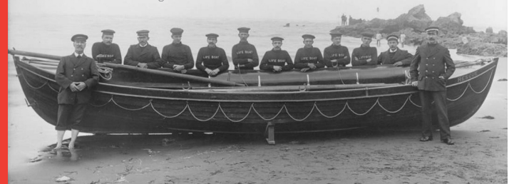
New Zealand's first Coastguard Unit. Sumner Lifeboat 1890.

These people provide around 240,000 hours of their time every year to make sure that our local boaters can enjoy the magnificent waterways that we have, secure in the knowledge that should anything go wrong Coastguard will be there to help.